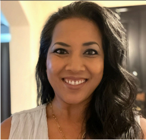
SENIOR CHAIR - SOMALY